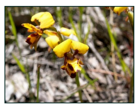
BEE ORCHID (DIURIS LAXIFLORA)