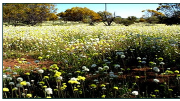
POM POM EVERLASTINGS

There are some beautiful patches of colours forming at Jibberding Reserve. Assorted everlastings and pink daisies are scattered amongst the cream coloured pom poms. The everlastings are not as tall or dense as previous years due to lack of rain but the area still makes for a nice camping spot for those travelling further north in the direction of Paynes Find, especially as the wattles and native bushes begin to bloom. If you do go out to Jibberding I recommend including a visit to the Cailbro Mudbrick School which is not far from the rest area. This is a lovingly maintained piece of local history. Shire maps are available for free in the Discovery Centre to direct you to the site.