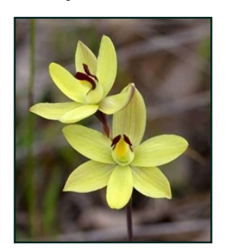
LEMON-SCENTED SUN ORCHID (THELYMITRA ANTENNIFERA)